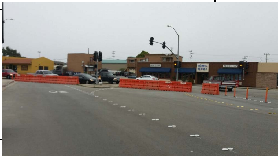
West Broadway closure at Del Monte Ave