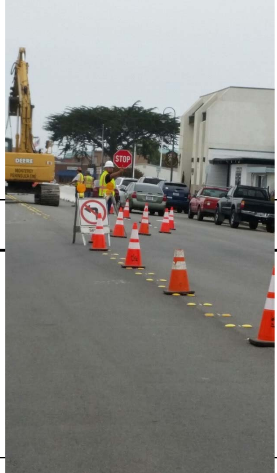
Traffic control for K rail placement