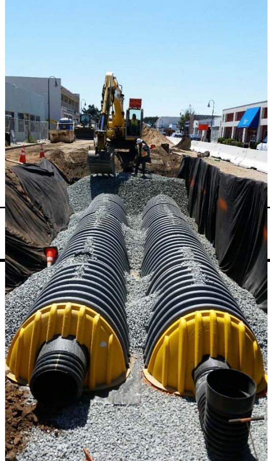
Infiltrator #2 rock backfill