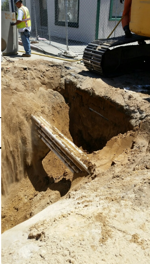
Exposed AT&T conduit, Hillsdale/Broadway