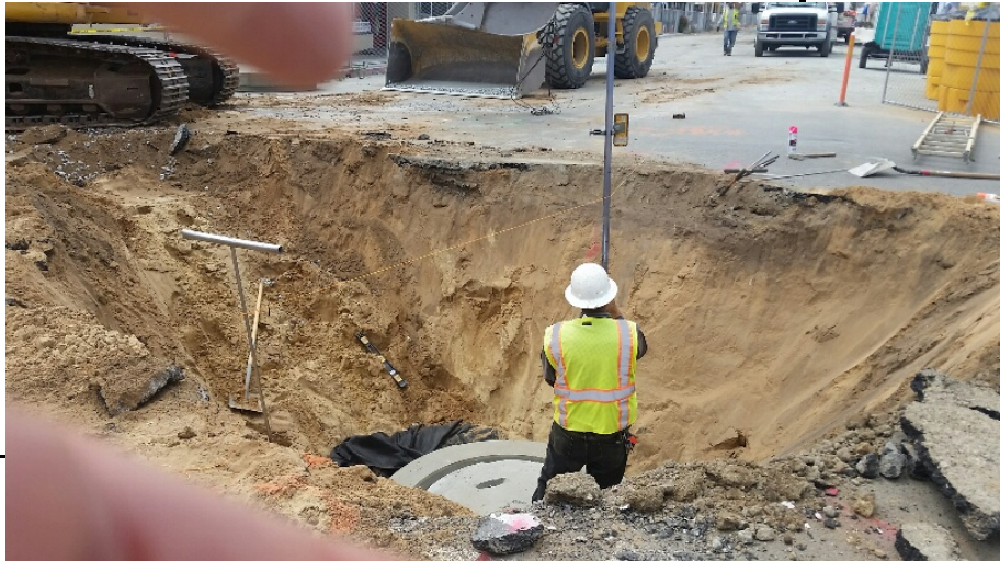
Placement of drainage structure, 6e