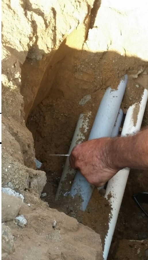
Conflict with electrical and irrigation conduit, DS 6d